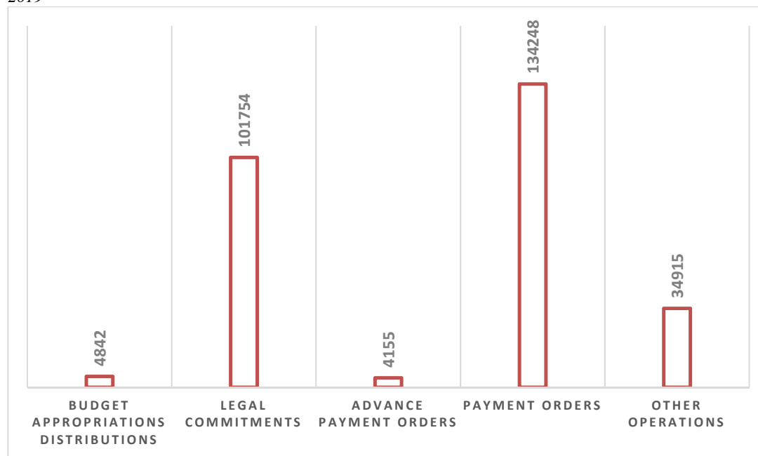
Chart no. 1. The number of operations presented for the OPFC visa in the Ministry of Internal Affairs in 2019